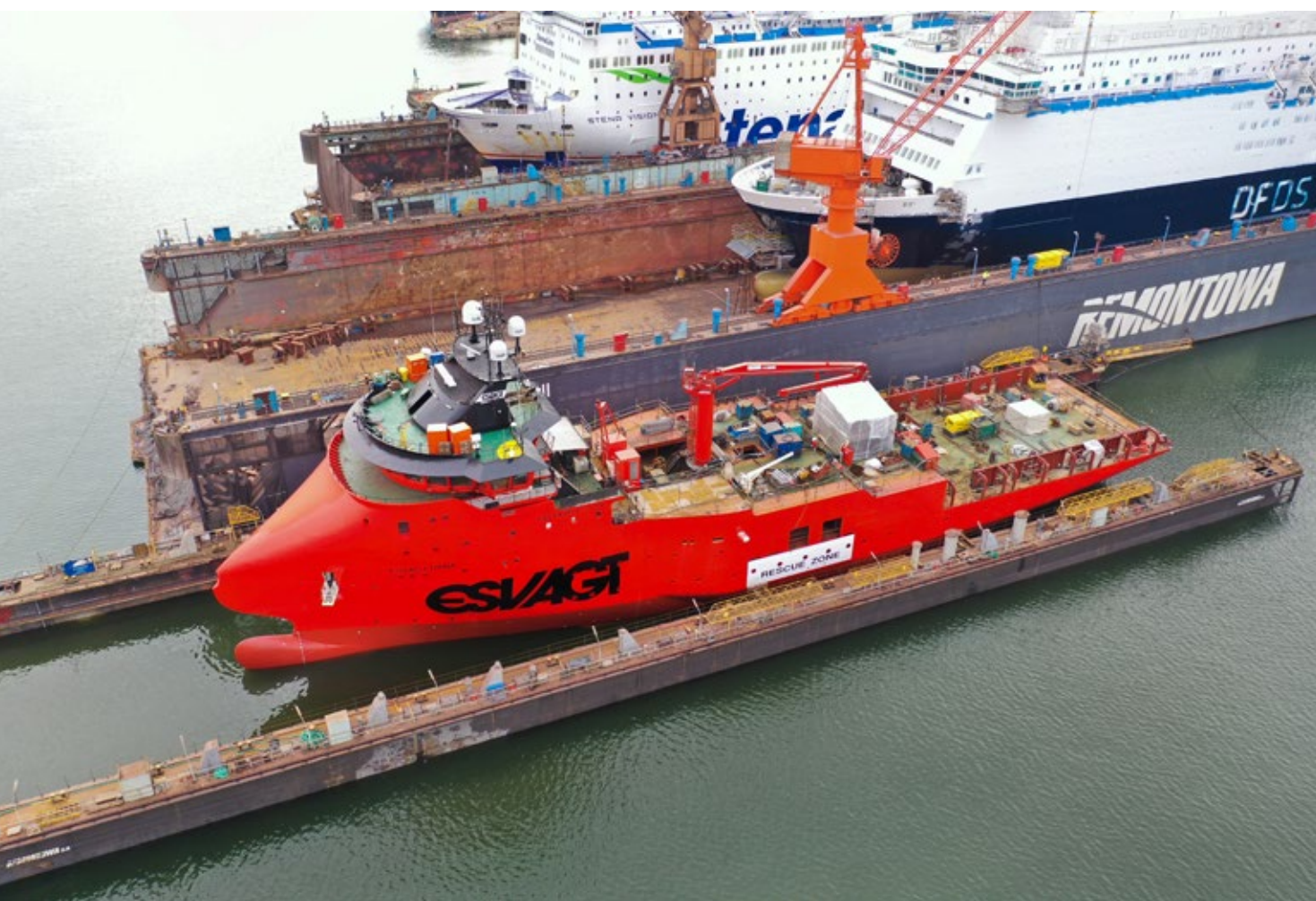
Esvagt Dana fitted with sponsons, leaving the dock in Remontowa

In addition to the two Esvagt FRB lifeboats, Esvagt Dana will also have a daughter craft attached, enabling Esvagt Dana to solve a larger group of tasks for TotalEnergies with one ship. Furthermore, the rebuilt Esvagt Dana has a rescue capacity for between 110 and 140 survivors.